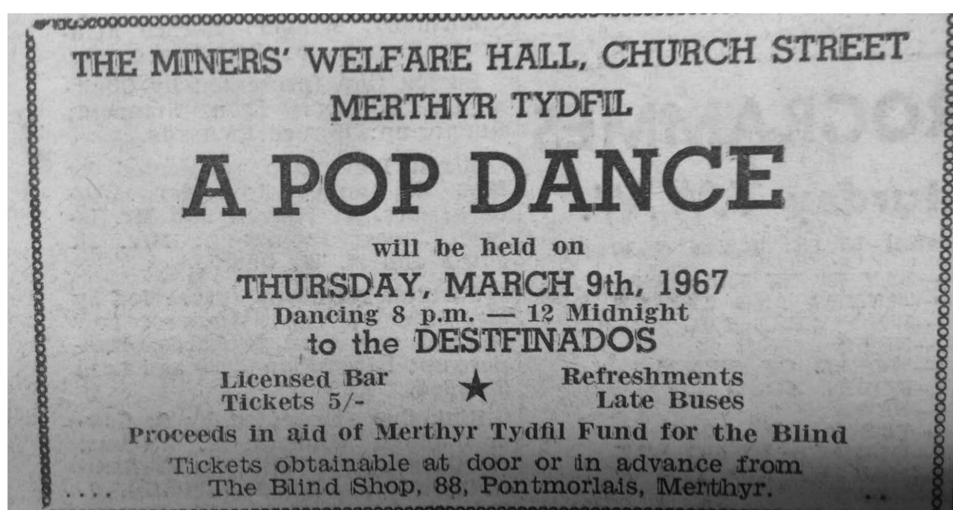
Two Adverts Featuring the Desafinados From the Express, March 1967.